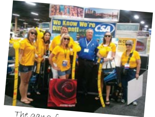
The gang from Signtech (San Diego) stopped by to say hello and pick up their CSA shades!